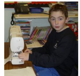
Design & Technology Masterclass