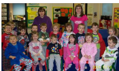
Children in Need Pyjama Day