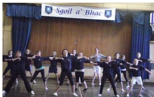
S1/S2 Pupil-led Dance Group

In S1/S2, pupils participate in a weekly Rich Task (Thursdays 1.10-3pm), with the options changing each term. This session, choices have included: