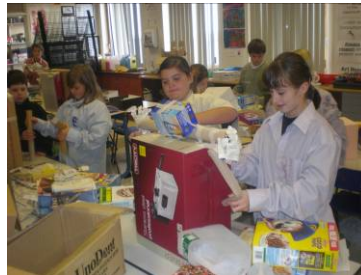
Art & Design Model Making