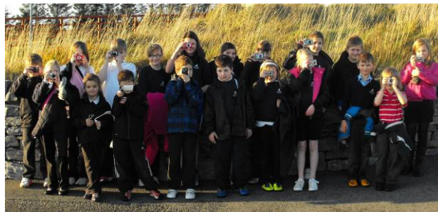
Primary Photography Masterclass