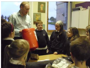
Science Energy Workshops