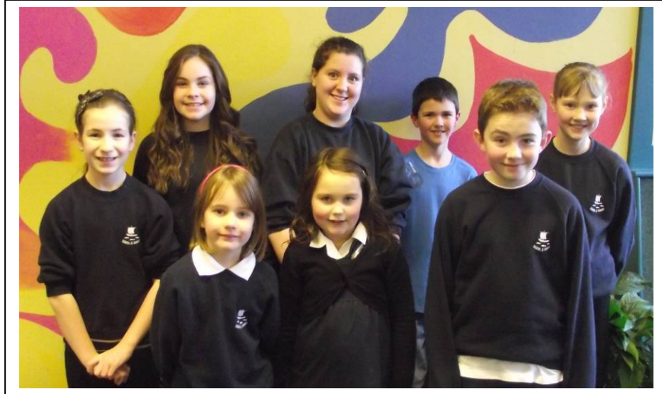
Pupil Council 2011-2012

The Pupil Council, elected each session, meets several times a term, to plan and organise activities and discuss new ideas and issues.