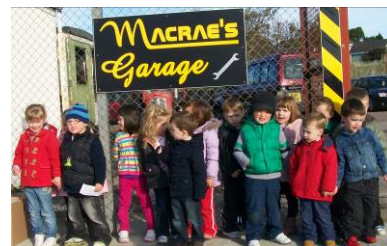
Learning in the Community

The Gaelic Nursery, located on the school grounds, caters for pupils from 3-5 years and, this session, has a roll of 25 pupils. The three staff work closely with infant teachers from the Primary department to ease transition to P1. Nursery staff and pupils use the school regularly (e.g. weekly gym lessons and Gaelic singing sessions) and pre-school pupils have a programme of daily half-hour Gaelic classroom lessons to develop the language further and to familiarise the children with the school. A Care Commission Inspection in May 2010 rated Sgoil Araich Loch a' Tuath "Excellent" in the two aspects inspected, i.e. Quality of Care and Support and Quality of Staffing. (*See Appendix for daily routine)