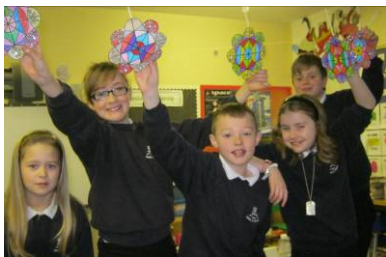
Primary 3-D Design

Masterclasses (daily from 11.30am, for a week each term) include: Creative Cookery; Design and Technology; Photography; Drama; ICT; Textiles and Science. Pupils are given an opportunity to say what they want to learn and their choices are taken into account when drawing up a list of Masterclass (Primary) and Rich Task (S1/S2) options.