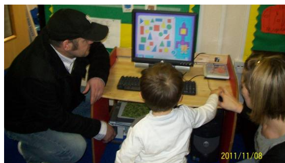
Pupil-led Parents Evening in Sgoil Araich Loch a' Tuath

Parents are always welcome at the school. Appointments may be made to meet with any staff members, by phoning the school office, to arrange a mutually convenient time.