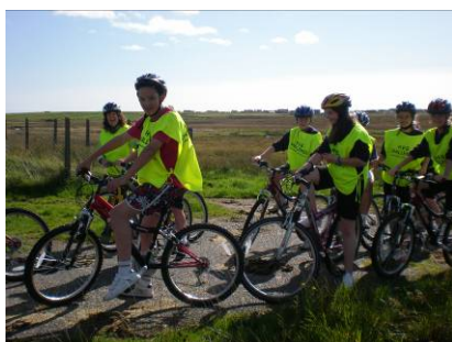
S1/S2 Cycling Group

Meetings are held with Nicolson Institute management and Learning Support staff, throughout the year, to prepare pupils for the transition and S3 subject choices. The Nicolson Institute, Stornoway (Tel: 707000).