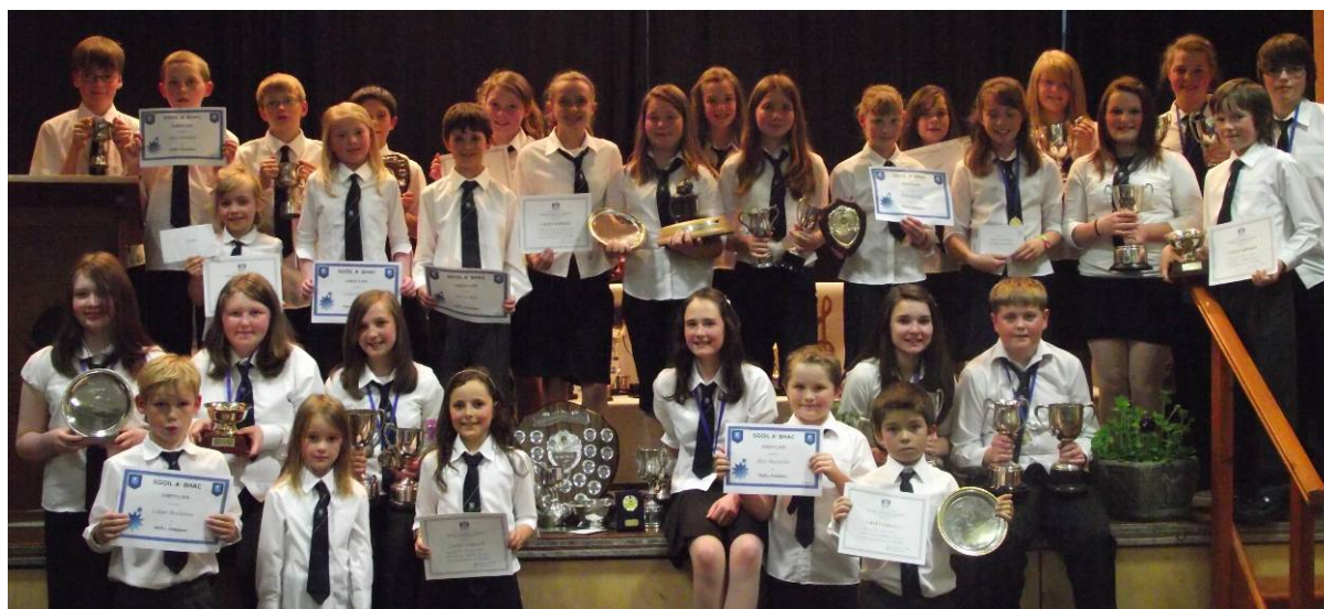
Sgoil a' Bhac Prizewinners June 2011

Opportunities for achievement are planned. Pupil-led assemblies are held each term, where all classes (on a rota basis) present their learning, through their chosen media: music and song; drama or Powerpoint presentations. At the end of each assembly, Certificates of Achievement are presented to pupils, from P1 to S2, for a range of successes.