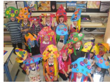
Infants Art Attack!

Pupils develop core Literacy and Numeracy skills daily, with slots allocated each morning, first for Literacy, followed by Numeracy and Maths. Other curricular areas are covered mostly through project work, usually in the afternoons. In addition, Primary pupils currently have specialist teachers for Art, Music and PE. The YMI programme allows pupils from P5 – 7 to opt for tuition in one instrument of their choice, with sessions being held weekly in chanter, string and brass.