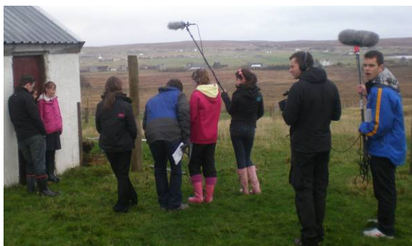
S1 Gaelic Class (Native Speakers) recording for Film G

Dynamic Youth Awards (Community Education personnel) in Secondary formally recognise their skills.