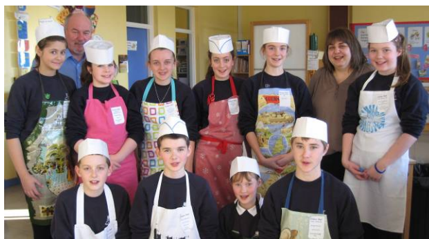
S1/S2 Future Chef Competitors

Achievements are promoted at school level (assemblies and newsletters), in the community (local monthly newspaper 'Loch a' Tuath News') and through collaboration with parents, in individual pupil reports.